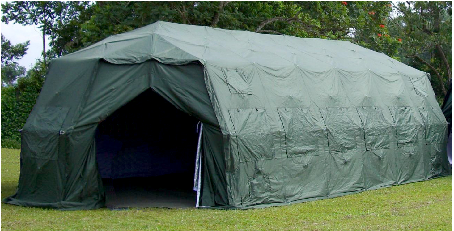
6A model, A series